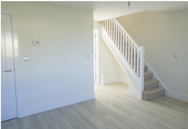
Living Room/Entrance Hall