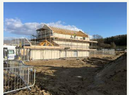
Self-builders' superstructures are going up quickly.