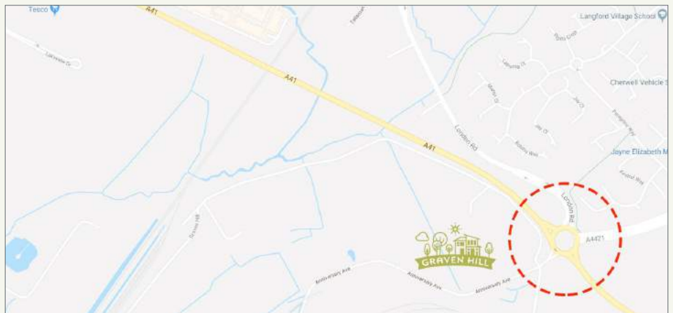
Location of the Rodney House roundabout on the A41

ensuring that traffic flow can be monitored and maximised.